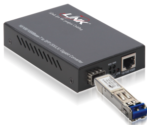
Use with Media converter

High density connections between networking equipment